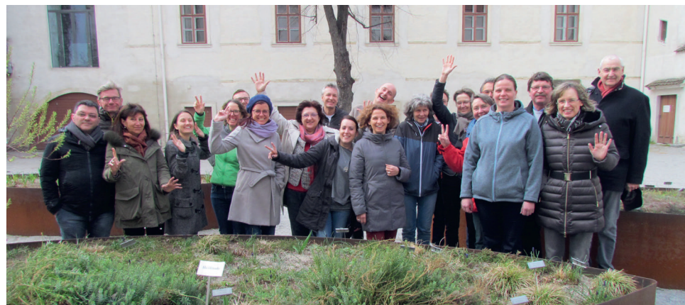
Donau-Auen NP / AG7 Vienna meeting, March 2019