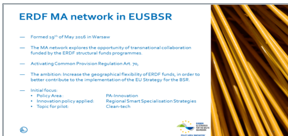
Table 6-13 The ERDF MA network in EUSBSR 120